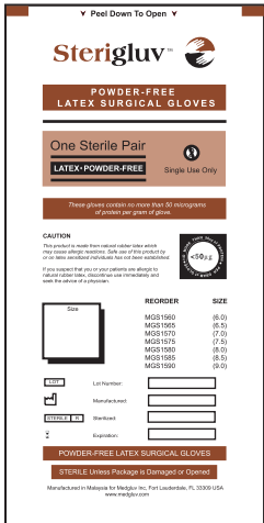
Sterigluv™ Latex PF